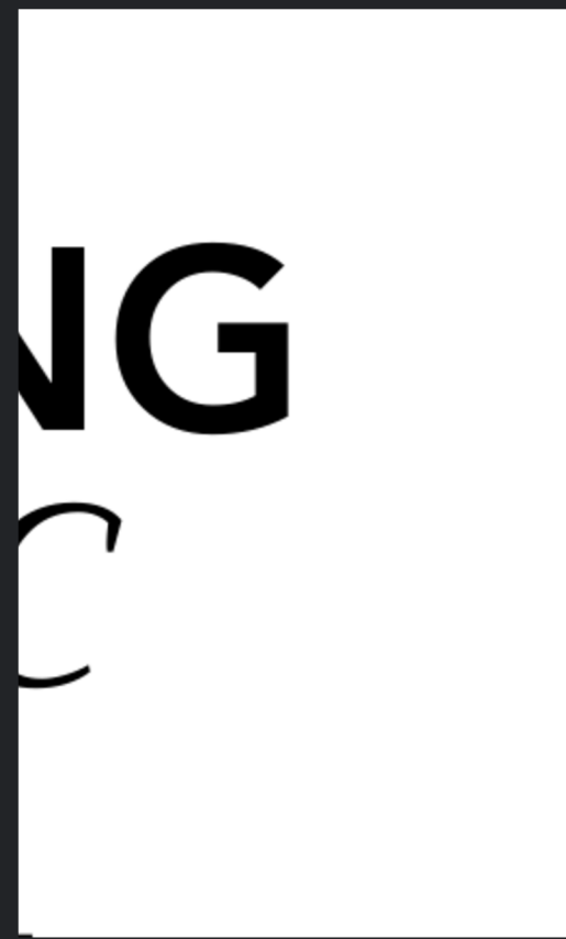
Visual Brand Guidelines