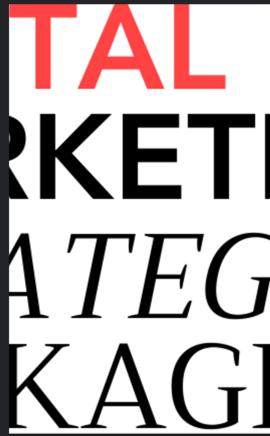
Social Media Resources