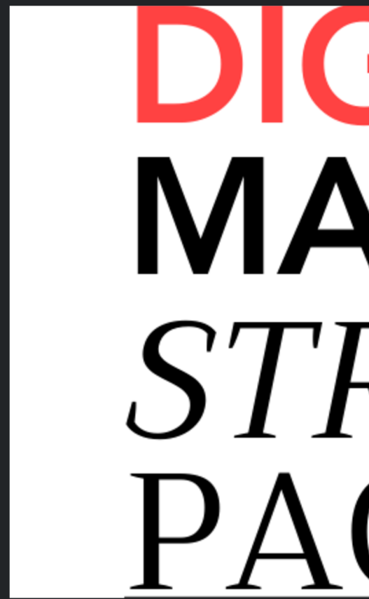
Website Banners and Graphics